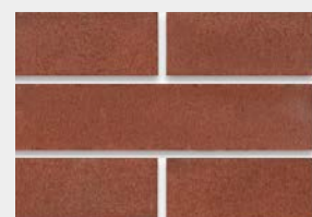
St. Cloud Blend