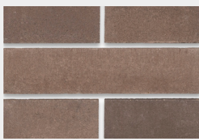
Jefferson City Blend