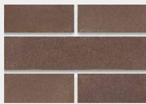
Panama City Blend