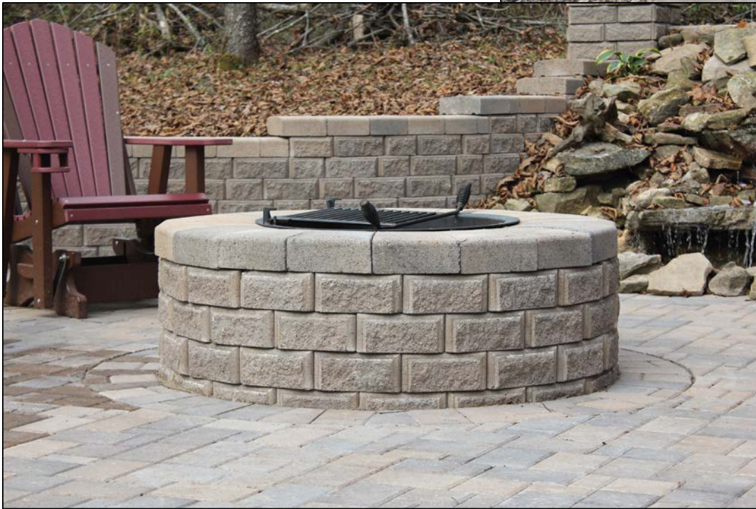
EverLoc ® Fire Pits