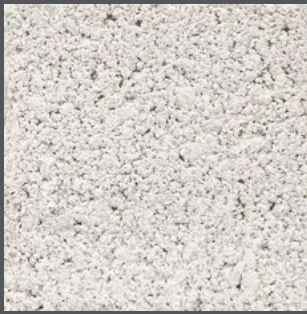
Mont Blanc JCL-3013