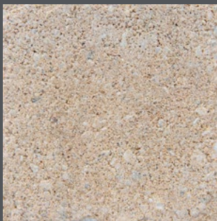
Summit Silt JCL-3582