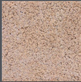
Shoreline Sand JCL-3063