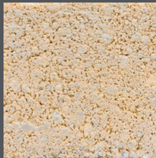
Canary Islands JCL-3532