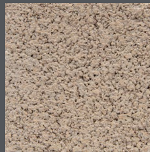
Speckle Stone JCL-3641