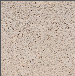
Cave of Crystals JCL-3522