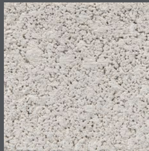
Oyster Bay JCL-3562