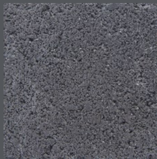
Black Boulder JCL-3621