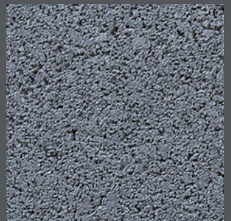
Black Canyon JCL-3992

NOTE: Actual colors may vary from current production runs. Always contact a Johnson Concrete Products sales representative for samples.