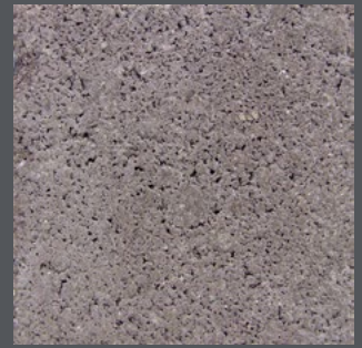
Ravine Mirage JCL-3281