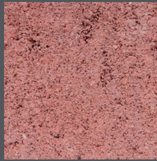
Lava Rock JCL-3211