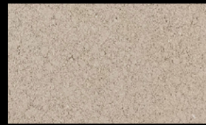
Smoky Quartz JCL-C107